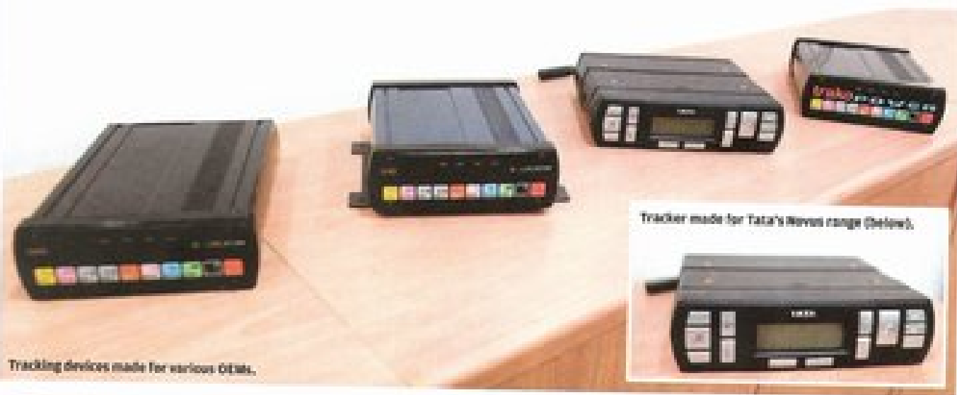
Tracking devices made for various OEMs.

Applied Electro Magnetic is helping fleet owners monitor vehicle movement and industry with its automated production monitoring system, says P Tharyan .